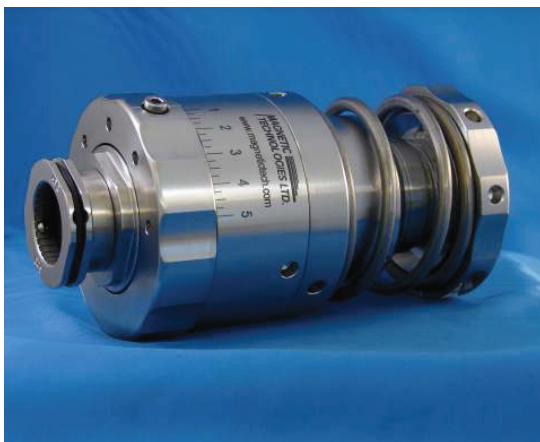
Alcoa Magna Tork drop in unit

Rebuild Tool Kits available for every model to allow customers to service and rebuild headsets in house. Training available from highly qualified capper technicians.